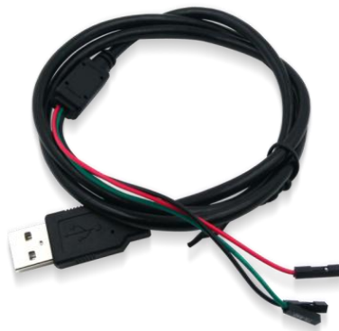
Figure 1-2 MY-UART012U

The USB plug of MY-UART012U connects with PC and the other end connects to Rico Board. The detail connection is as below: